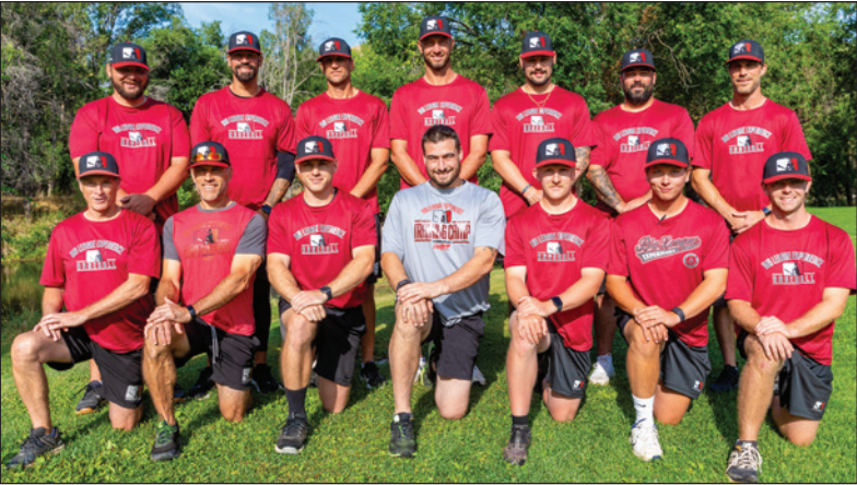
An Elite staff heads up our Instructional team

All players leave with individual written reports/evaluations from their coach.