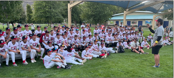
Two time MLB All-Star Shea Hillenbrand addresses camp on setting yourself up for success