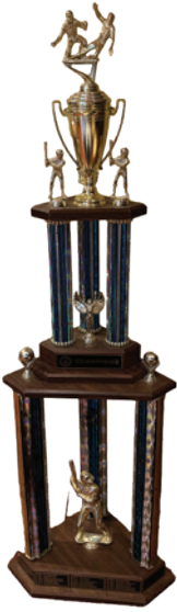
Pitching and Defense wins championships