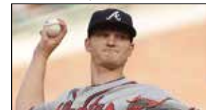
Mike Soroka Now with the Chicago White Sox, former World Champion with the Atlanta Braves 2021