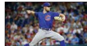
Rowan Wick Chicago Cubs (Vancouver Cannons)