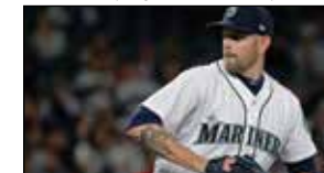
James Paxton Player the 2024 campaign with the Boston Red Sox and is presently a free agent (ND Blue Jays)