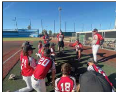
Two time MLB All-Star Shea Hillenbrand passes along his wisdom in post game talk with 12U Vegas travel team.

Big League Experience, LTD Head Office: 14836 Thrift Avenue, White Rock, B.C. Canada V4B 2J7 Phone/Fax: 604-531-9916