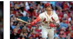
Tyler O'Neill Former St. Louis Cardinals, now Boston Red Sox and 2020 & 2021 Gold Glove outfielder (Langley Blaze)