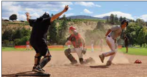
Tight play at the dish goes in favor of the runner this time during Playoff game action at Futures "Elite" week.

Name: (please print) _____ Signature: _____