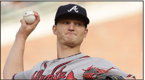
Mike Soroka Atlanta Braves - World Champion 2021 and 2019 All Star (PBF Redbirds)