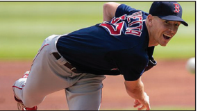
Nick Pivetta Boston Red Sox (Victoria Eagles)