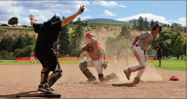
Tight play at the dish goes in favor of the runner this time during Playoff game action at Futures “Elite” week.

Name: (please print) _____ Signature: _____