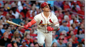
Tyler O’Neill St. Louis Cardinals and 2020 & 2021 Gold Glove outfielder (Langley Blaze)