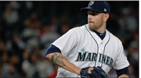
James Paxton Back with the Seattle Mariners after a tenure with the Yankees