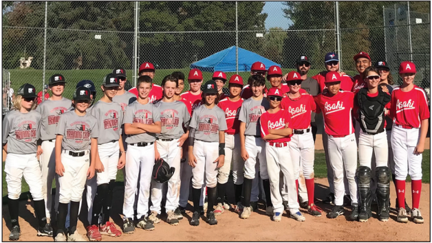
“More than Baseball”. A great photo of the Asahi Baseball team posing with Team BLE after a “Best of the West” tournament game in Kamloops.