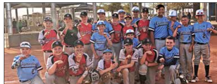
Team BLE 12U at USSSA NIT Invitational in Phoenix posing with their Championship rings and with Gameday Baseball from Colorado.

Milwaukee Brewers Scout Team: BLE Camps are used as identifiers for potential players to represent the Milwaukee Brewers organization at Perfect Game events and other elite Showcases - A great opportunity to be seen by MLB scouts and Collegiate Recruiters.